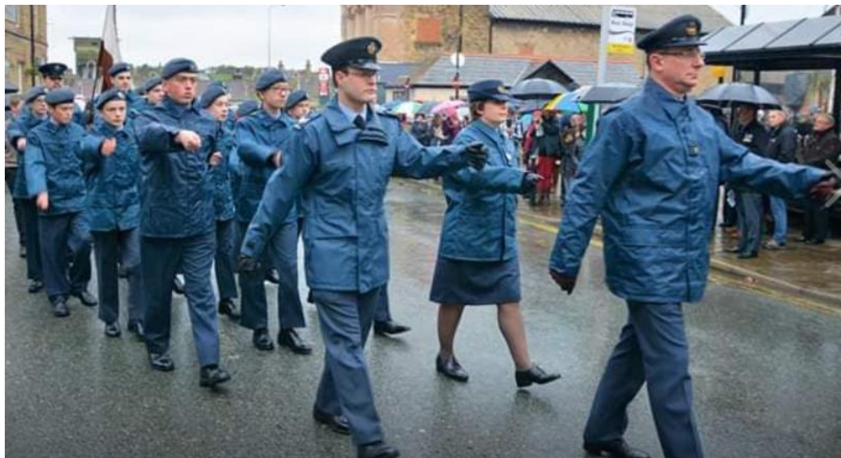
Carnforth Royal Air Force Air Cadets march in the 2018 Remembrance Day Parade