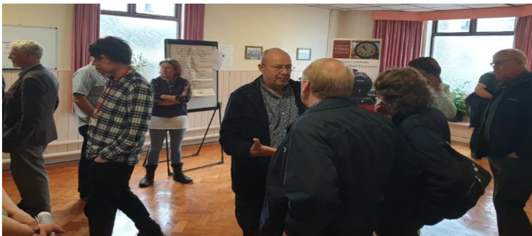
Councillors discussing the Carnforth Neighbourhood Plan Vision and Objectives and Policy Themes with residents

After all consultations have been completed the plan will be submitted to a government inspector appointed to forensically review the plan. If the inspector passes the plan, all residents and the local community will be asked to vote for or against the plan in a referendum. If approved, the plan will be formally adopted as a statutory part of the Local District Development Plan.