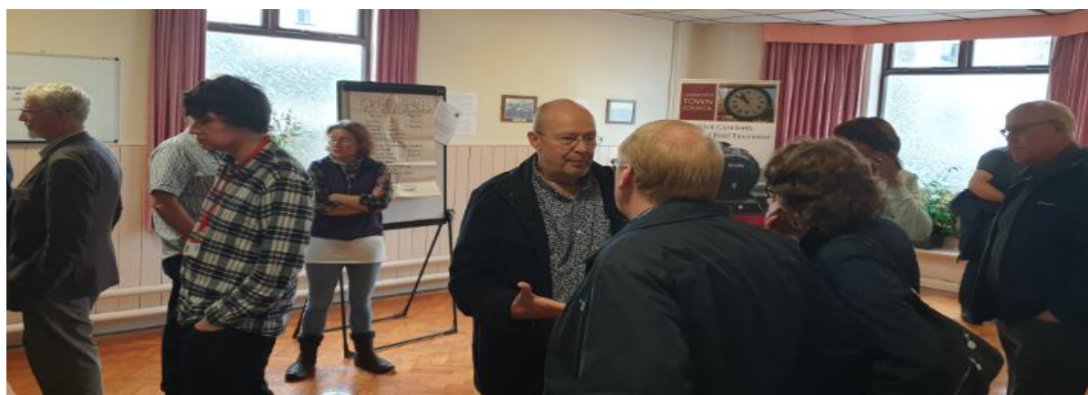
Councillors discussing the Carnforth Neighbourhood Plan Vision and Objectives and Policy Themes with residents

We are now directly asking our local businesses for their views through a survey available on our website http://carnforthtowncouncil.org/carnforth-neighbourhood-plan-business-survey/ and in paper form on request from the Town Clerk. The information/data received from this survey will be strictly confidential and will be vital in informing local policy. There will be further consultation in early 2020 when we hope to have a first draft of the Carnforth Neighbourhood Plan published.