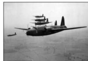
Wallington has been over Italy, (see Jack Astley