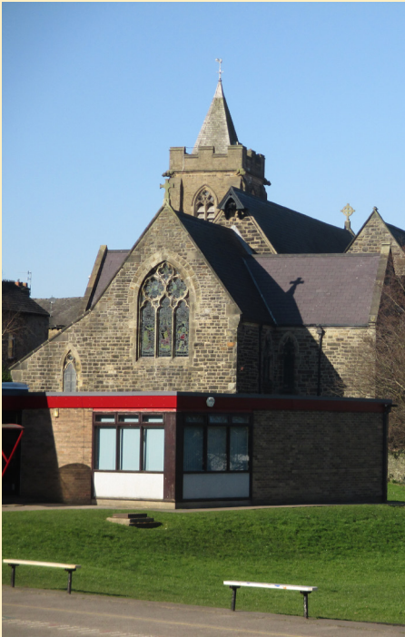
Christ Church, Lancaster Road