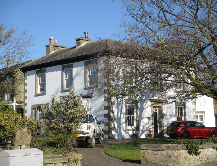
Hall Gowan, North Road