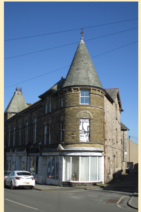
Former Co-op, New Street (1885)