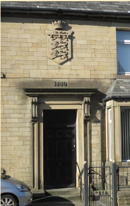
Police Station, Lancaster Road (1880)