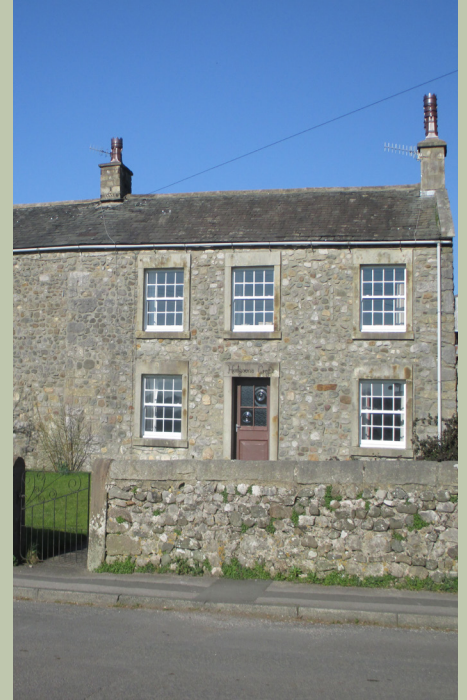
Hodgsons Croft, North Road