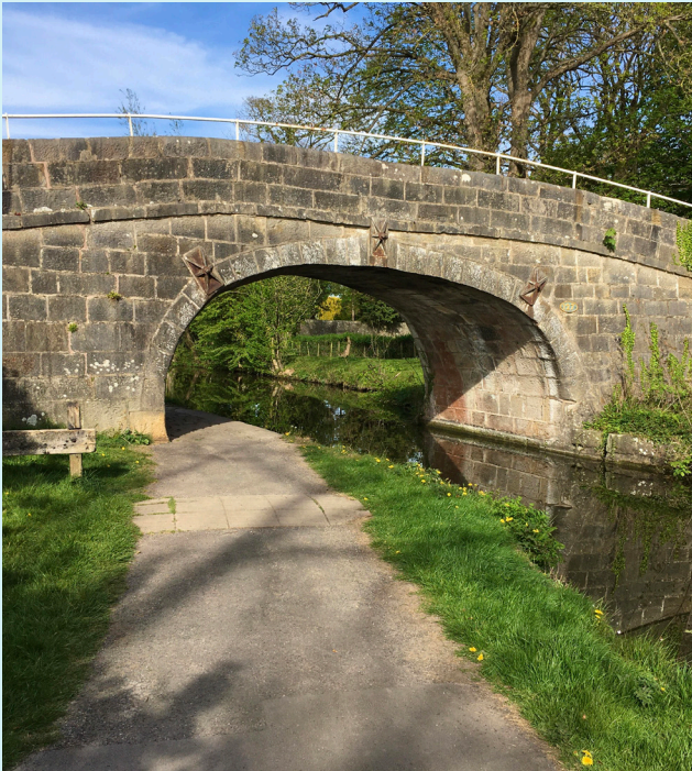
Thwaite End Bridge