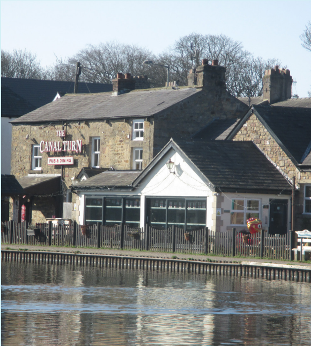
Canal Cottage / Canal Turn Public House