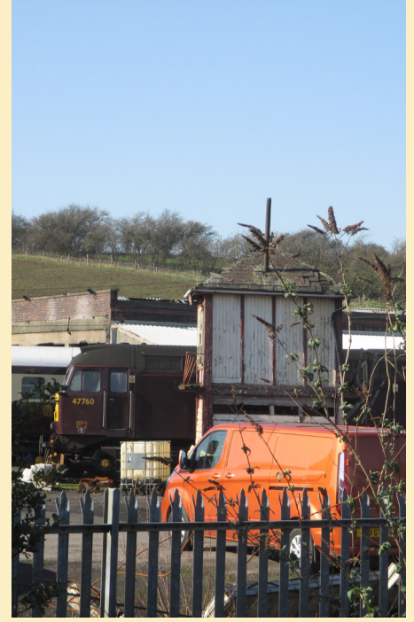
Former Selside Signal Box