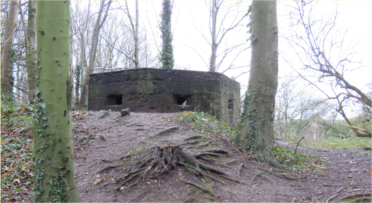
WWII Pill Box, Cemetery Woods