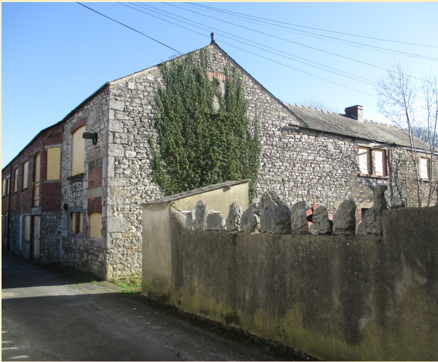
Former Morphy's Mill at Travis Perkins