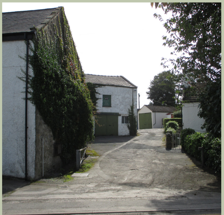
Barns formerly associated with Plane Tree House, North Road