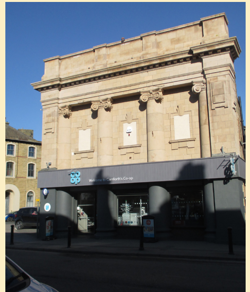
Roxy Cinema, Market Street – currently occupied by the Co-op (1912)