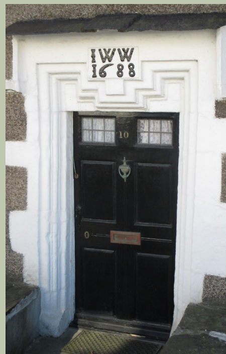
10 North Road