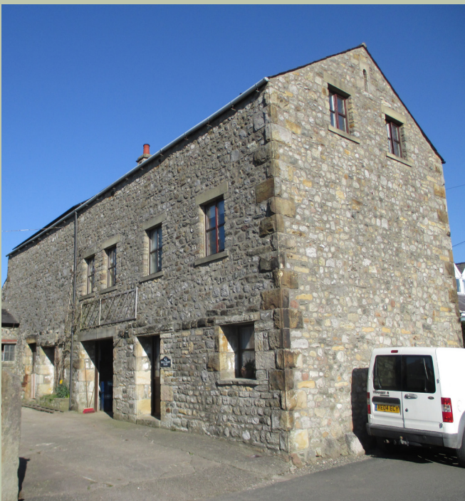
Hall Croft Barn, North Road