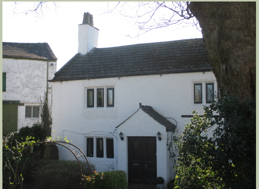
Plane Tree House, North Road