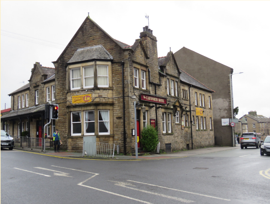
Carnforth Inn, Lancaster Road and Market Street