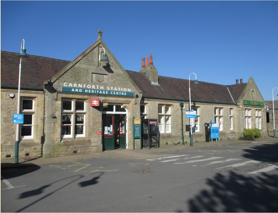
Carnforth Station (1880)