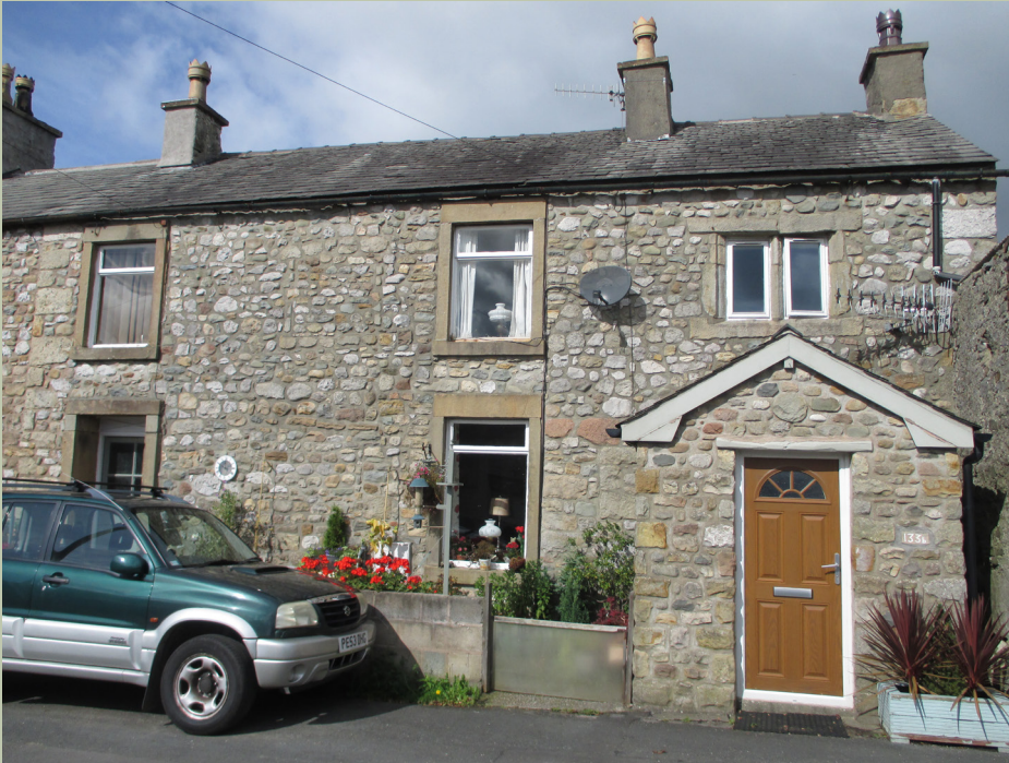
133a & 133b North Road