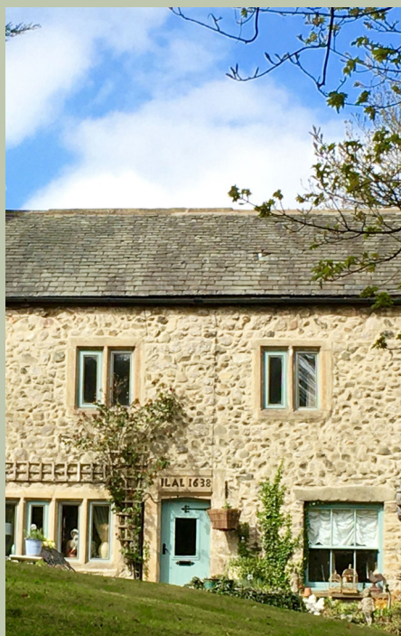
1 & 2 Hagg Cottages and Hagg Farmhouse