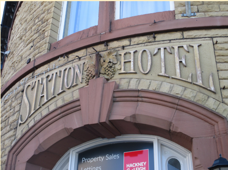
Station Hotel, Market Street