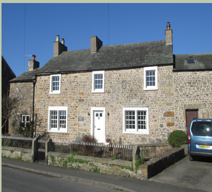
Carnforth House, North Road