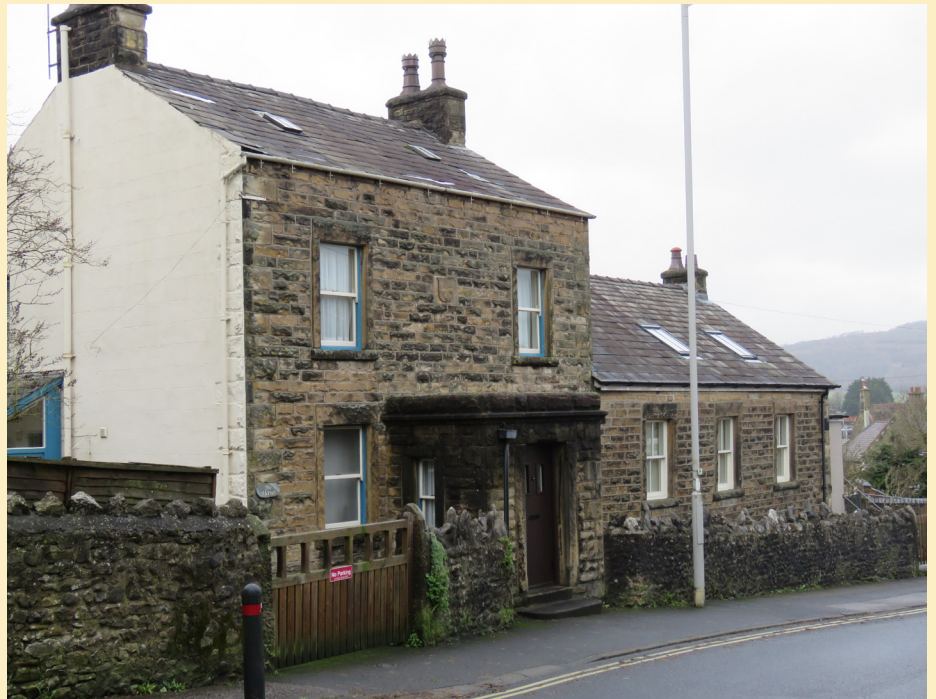
The Haws, Private School for Girls, Haws Hill