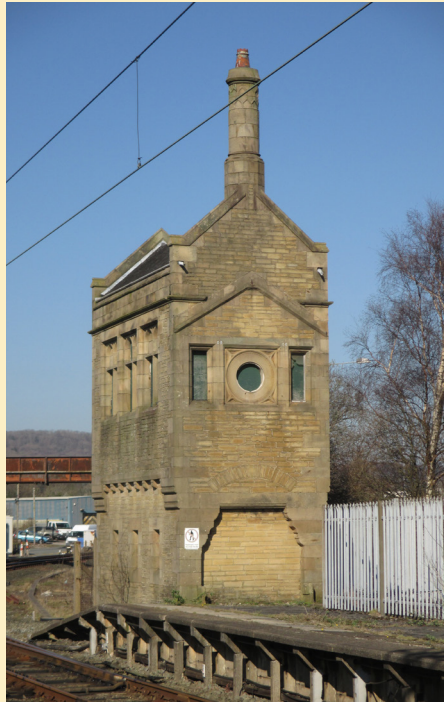
Carnforth Junction Signal Box