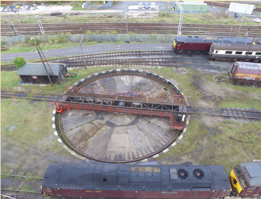
Locomotive Turntable (II*)