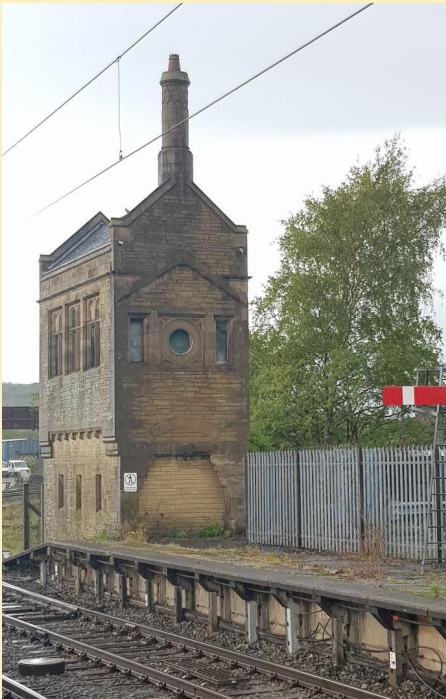
Former Signal Box, North end of Platform, Carnforth Station