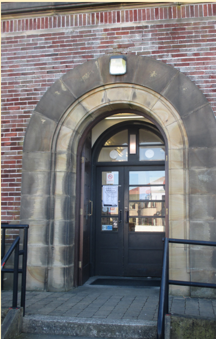
Lancashire County Library, Lancaster Road (1936)