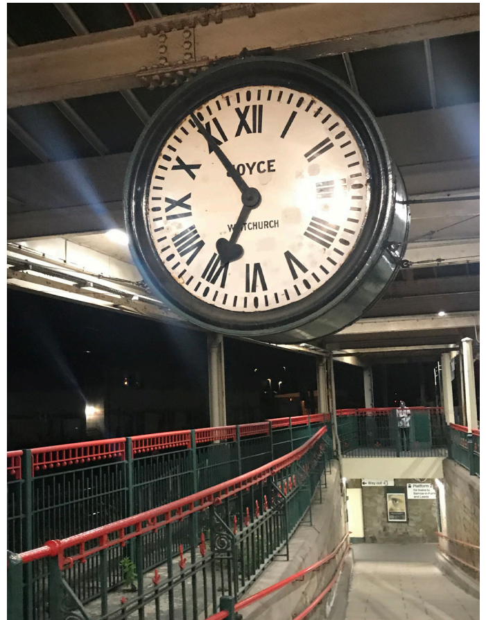
Carnforth Station Clock

The key to industrialisation and related development would only come in 1857 with the construction of the Ulverston and Lancaster Railway. The Company took its junction with the main line at Carnforth and was shortly taken over by the Furness Railway in 1862, connecting with its more ambitious line running around the Cumbrian coast. Therefore, access to ample supplies of haematite was suddenly opened up, leading to the early construction of the Ironworks close to the station. By 1872, over 100 houses for the workforce were under construction. The explosive growth of Industrial Carnforth had begun.