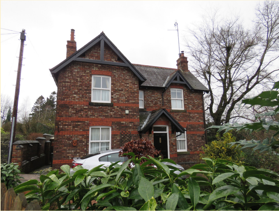
Station House, Station Masters House, Haws Hill