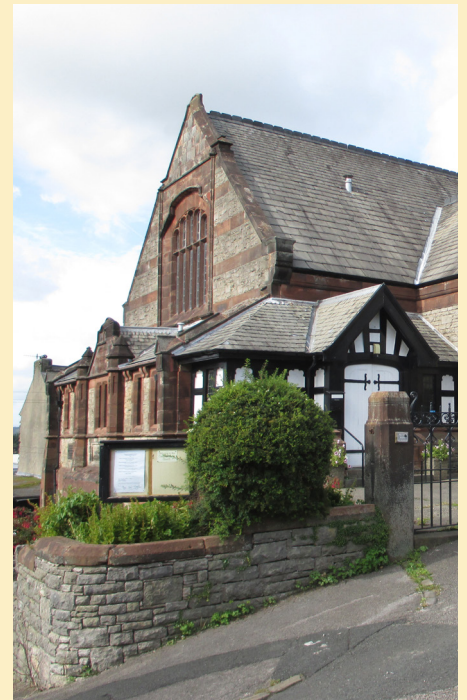
Hawk Street Congregational Chapel (1897)