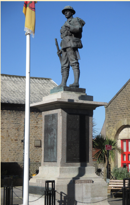
Carnforth War Memorial