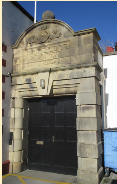
Civic Hall, Lower North Road