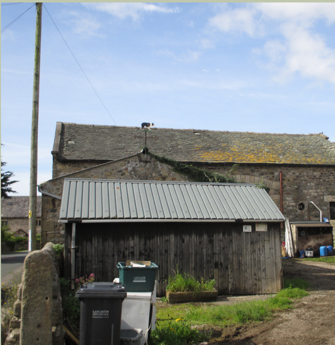
Atatched Barn at Hodgsons Croft, North Road