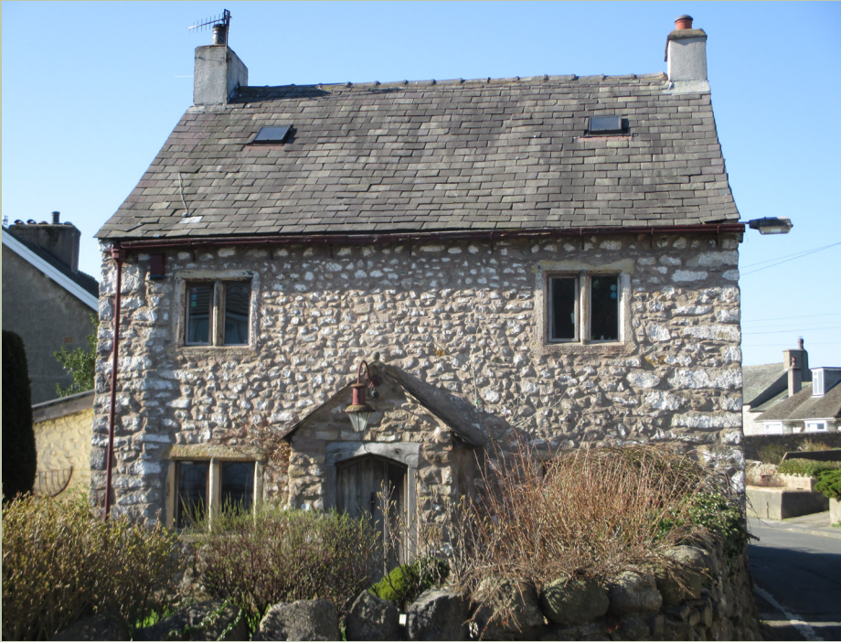
114 North Road, House and Barn