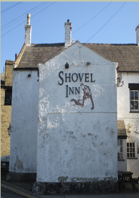
The Shovel Inn