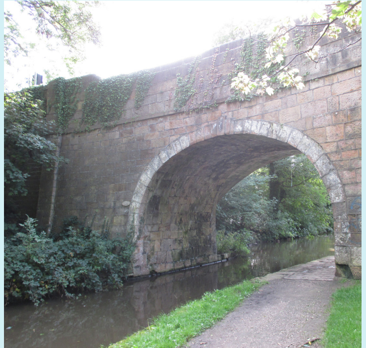
Kellet Road Canal Bridge