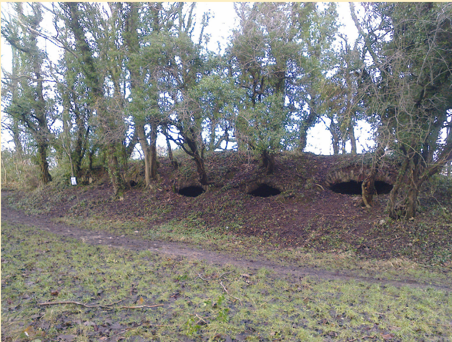
Coke Ovens, Thwaite End