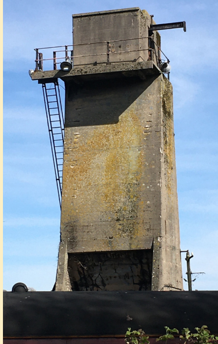
The Ash Plant