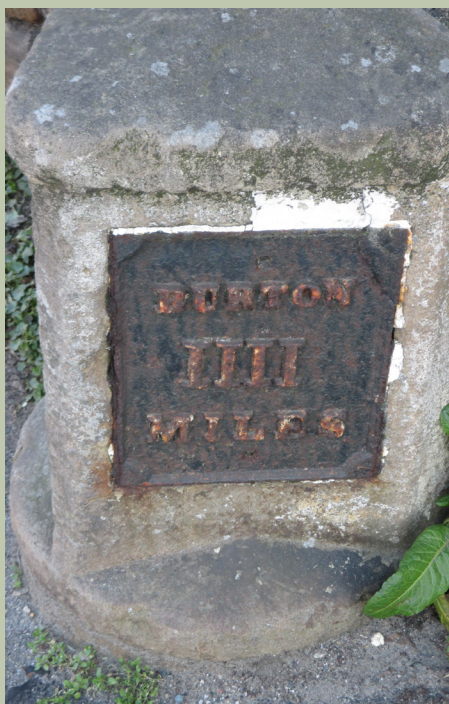
Milestone, 150m South of junction with Alexander Road