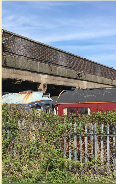
The Wagon Repair Workshop