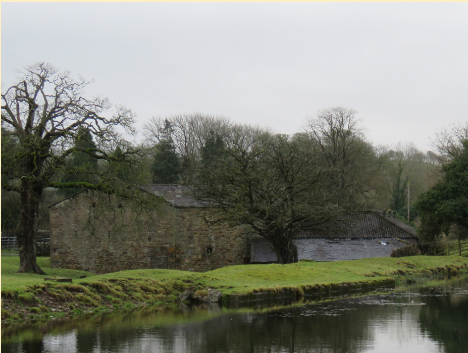
Thwaite Gate Farm