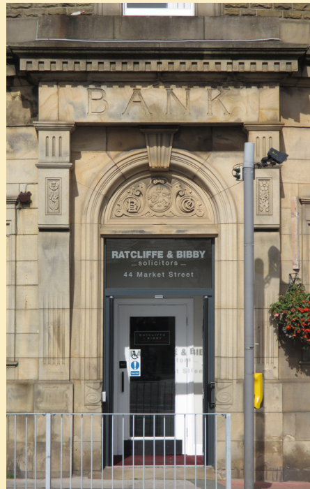
Former National Westminster Bank, corner Market Street, Scotland Road (1889)